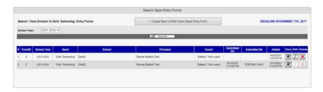
STEP 4: Once the entry form is submitted, an invoice will be generated and emailed to the Principal.

The image below shows both a submitted entry form and a saved one. If the entry form is only saved and not submitted, it can be edited up until the due date. Once an entry form is submitted, the financial form will be official and an invoice will be generated.