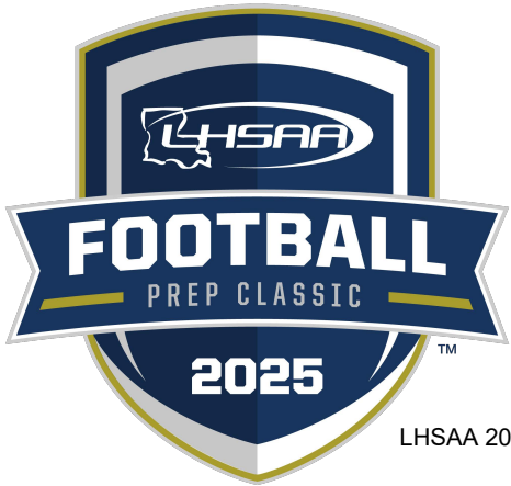
LHSAA 2025 Prep Classic Logo