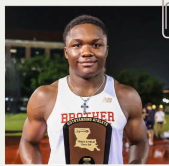
EASTON ROYAL BROTHER MARTIN HIGH SCHOOL

Author's Note: In my role as the Director of Communications, I have the unique privilege of attending nearly all sanctioned LHSAA State Championship events. Although the schedule is demanding, I have the privilege of seeing student-athletes from all walks of life, united by two things: their participation in Louisiana high school sports and their pursuit of a state championship. In my first year in this role, I've gained a deeper appreciation for high school athletics and for all the dedication that goes into making each season and event possible. Although my current role involves less writing than my previous positions, it has given me the opportunity to return to something I've always loved. While much of my work now focuses on press releases and public statements, I also have the chance to reconnect with my passion for feature writing, this time highlighting what I consider the purest form of sport: high school athletics. The goal is to highlight the best thing I saw at each state championship and share the unknown stories behind these events, capturing memorable moments for student-athletes, coaches, administrators, officials, and fans.